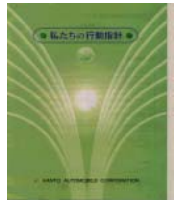
The Code of Conduct